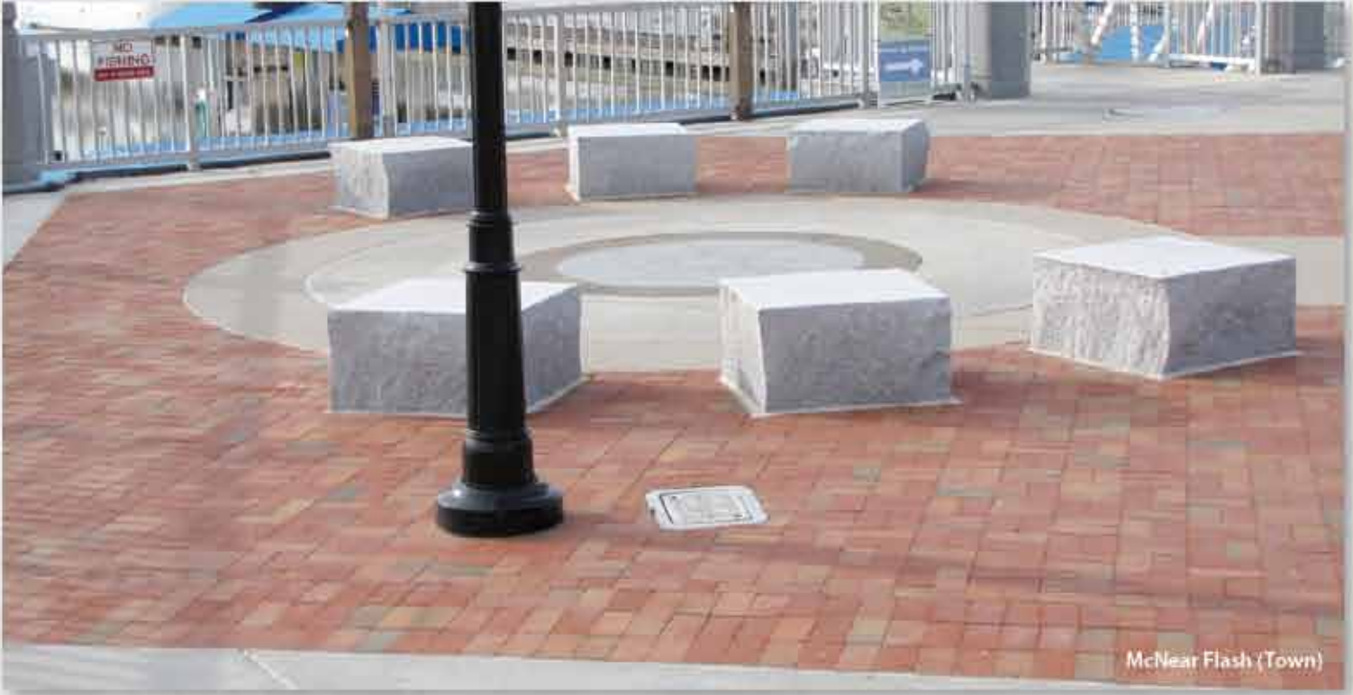
McNear Flash (Town)