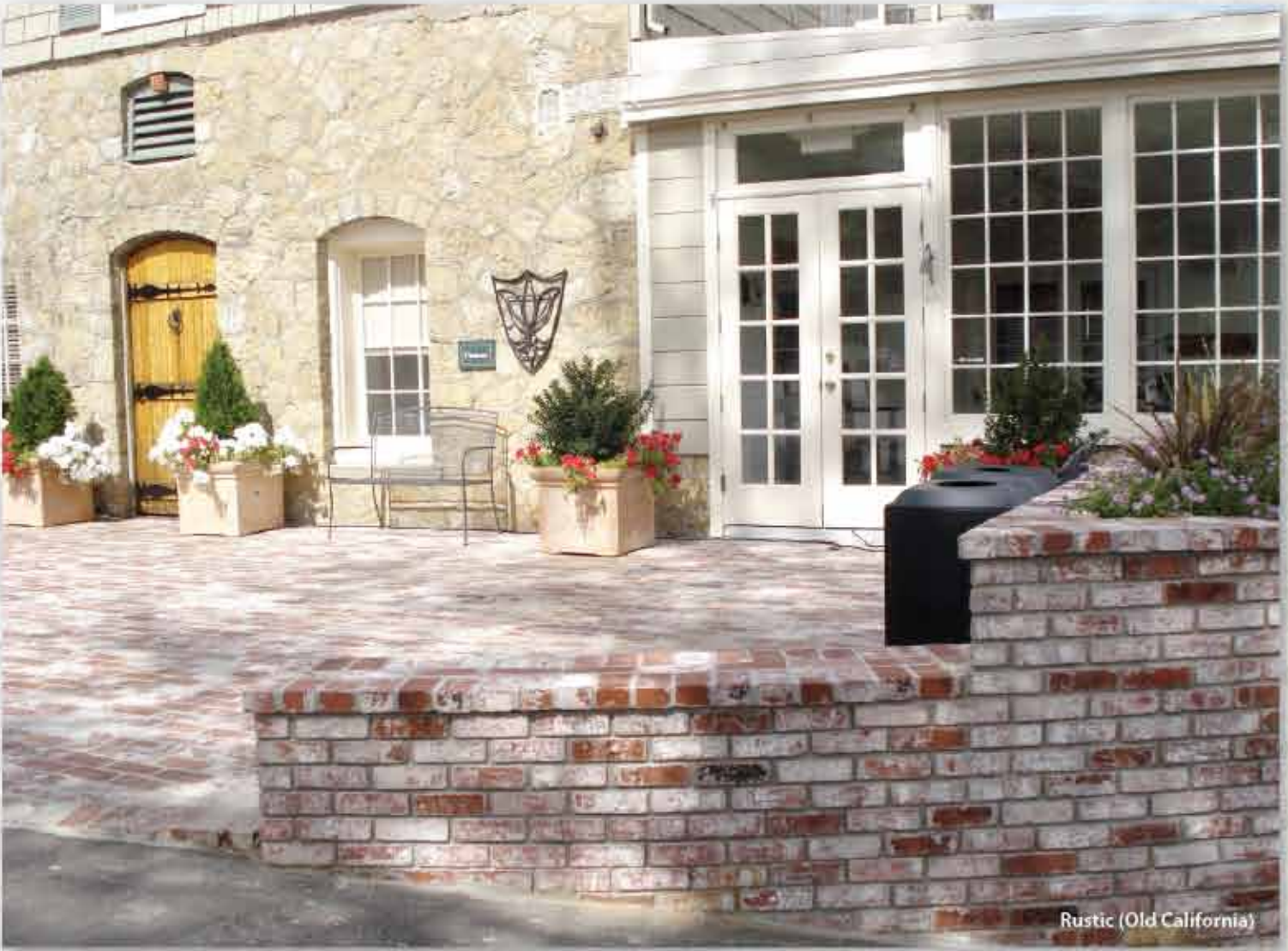
Rustic (Old California)