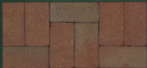
Rumbled® Full Range

Tumbled after firing to give an aged look of a paver that's been around for hundreds of years. 2 1/4" x 4" x 8"