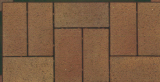
Georgian Edge Harvest