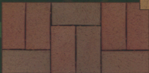
Georgian Edge Mahogany