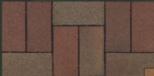
Georgian Edge Full Range

A beveled edge paver with spacer nibs (like Madison's English Edge®). Available in 2-1/4" x 4" x 8" and 2-3/4" thickness for heavy vehicular applications.