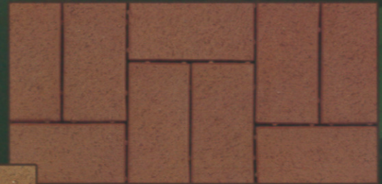
Georgian Edge Red