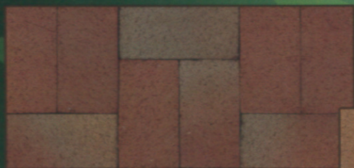
Courtyard Full Range (Modular Available)

Traditional straight edge 2 1/4" x 4" x 8" paver