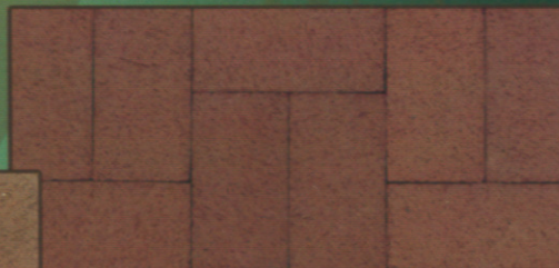
Courtyard Red (Modular Available)