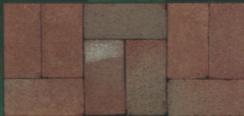
Rumbled® Main Street