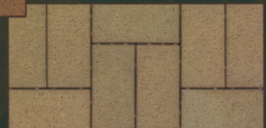
Georgian Edge Siesta